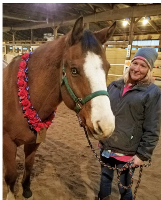
Thunder shows off his retirement garland.

After many years of service to TEC, this fall we retired our beloved horses – Tori, Bess, and Thunder. Tori was with TEC for 10 years. Bess and Thunder over 2 years each. They have been placed in loving homes where their work load will be lighter, and they can enjoy lots of TLC from their new families.